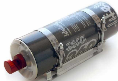
Crew Compartment Unit

Significantly smaller and lighter than the current alternatives Zero 360 offers far better packaging within the confines of the modern fighting vehicle with improved fire suppression performance.