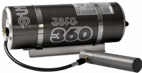
Engine Compartment Unit

Zero 360 represents over five years research and development, producing a major step forward in vehicle on-board safety. The Lifeline Zero 360 system contains 3.0kg of gaseous extinguishant discharging through specially designed high-performance nozzles. Performing in a similar way to the now banned Halon (BCF) systems Zero 360 has been approved by the FIA for use in international motorsport and is already selected by the majority of world championship winning teams.